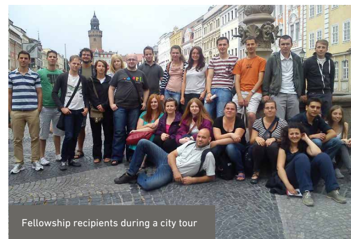
Fellowship recipients during a city tour