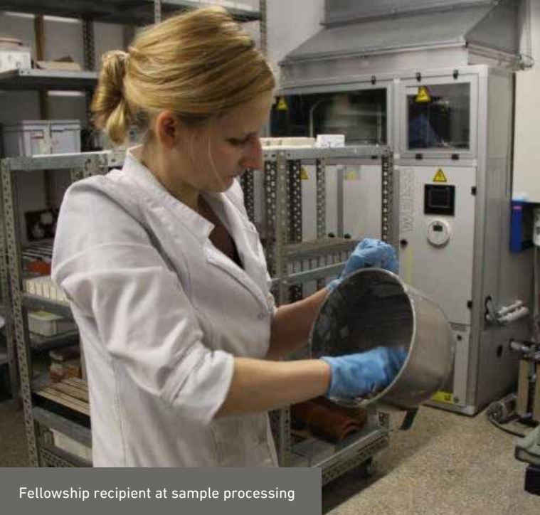
Fellowship recipient at sample processing