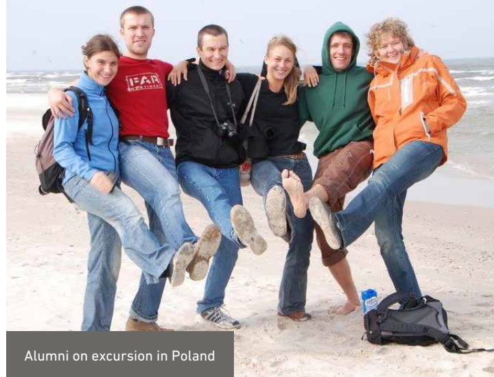
Alumni on excursion in Poland

During the fellowship practical solutions for current environmental issues are developed. After their stay in Germany the alumni are well qualified to tackle these issues in their home countries thus assuring efficient knowledge transfer. Working closely together in an international context helps to breakdown existing barriers. The acquired contacts will create a strong network of highly committed environmental experts.