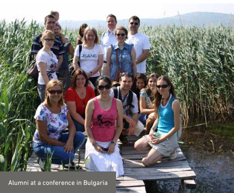
Alumni at a conference in Bulgaria

DBU coaches its fellows during the whole stay. During seminars the fellowship recipients can present their topics and their results and network with each other. Furthermore, DBU welcomes and supports individual initiatives to organize further professional events and seminars.